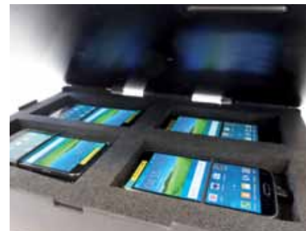
Up to three P3 Antenuatr-Boxes can be mounted into the back and side windows of each measuring car and up to four smartphones can be used to test up to four providers simultaneously.

Real live testing confirmed the advantage of using the differently polarized original MiMo antennas, as this increases the likeliness of achieving maximum data rates due the the higher linear independence of the antenna signals.